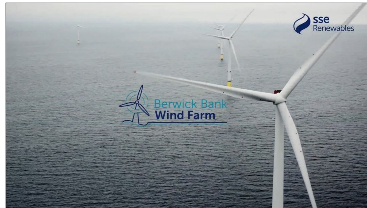
A project video